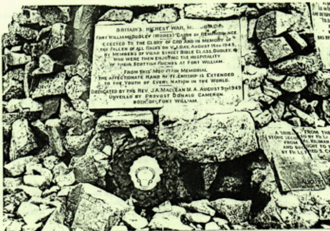
BRITAIN'S HIGHEST WAR MEMORIAL. On the top of BEN NEVIS.